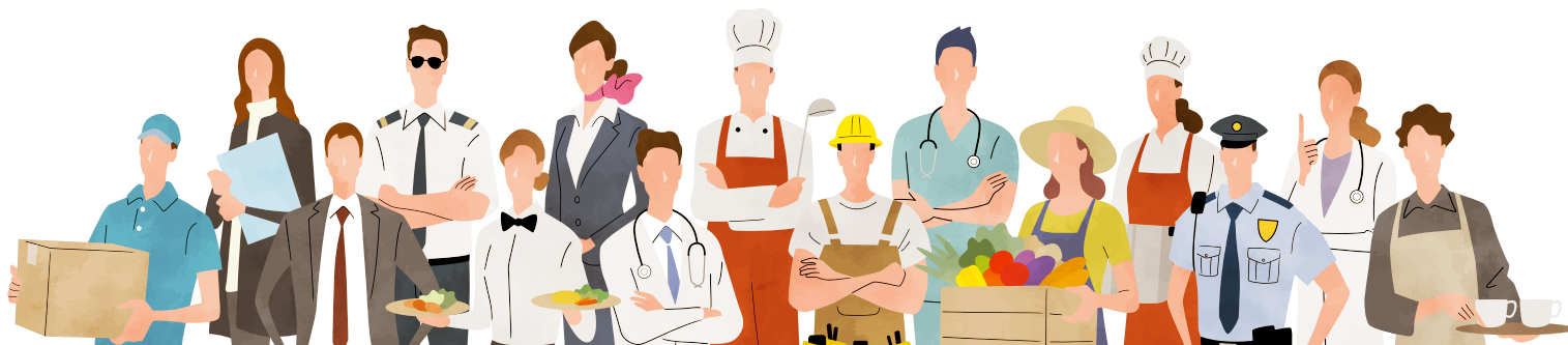
Decedent occupations from 2023 federal estate tax returns

Total estate tax collections, according to the report, came to $44.4 billion in 2023, an amount that is scarcely a rounding error in the multitrillion-dollar federal budget. However, for the 3,690 families required to come up with that tax payment, it was a very big deal indeed. That's why estate planning remains very important.